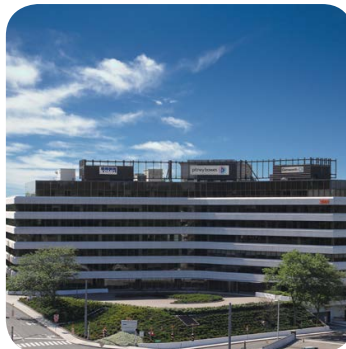
3001 STAMFORD SQUARE STAMFORD, CT – 290,000 SQ. FT.