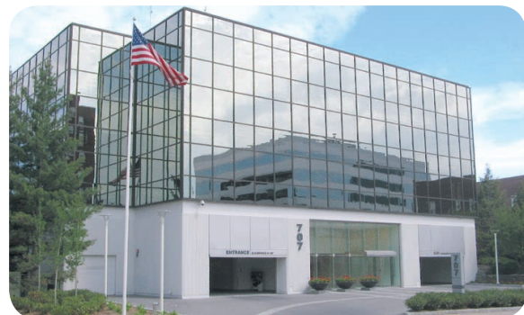
707 SUMMER STREET STAMFORD, CT – 74,000 SQ. FT.