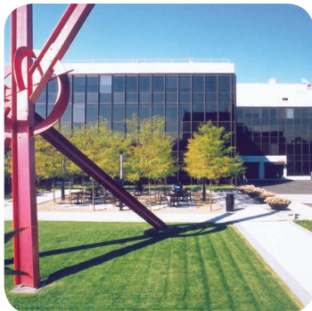
GREENWICH PLAZA GREENWICH, CT – 354,000 SQ. FT.

The experienced, full-time, on-site property management team includes a dedicated vice president/property manager and a property operations administrator. They are supported by full-time engineers, security officers and porters. This team is responsible for operating and maintaining the building and responding to clients' needs. Ashforth's unique client services program includes quality building services, regular communications with clients, client appreciation events and community-based activities all designed to provide a productive environment and create a sense of community at Greenwich Plaza.