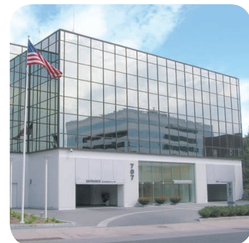
707 SUMMER STREET STAMFORD, CT – 74,000 SQ. FT.